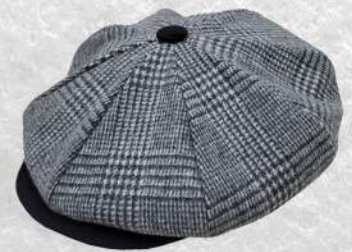
GREY GLEN PLAID