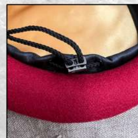
ADJUSTABLE METAL PULLER