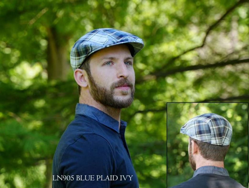
LN905 BLUE PLAID IVY