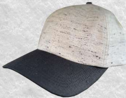
COOKIES N CREAM