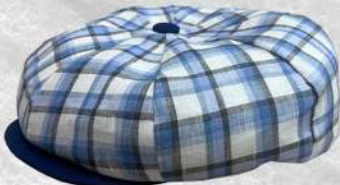
BLUE PLAID COMBO